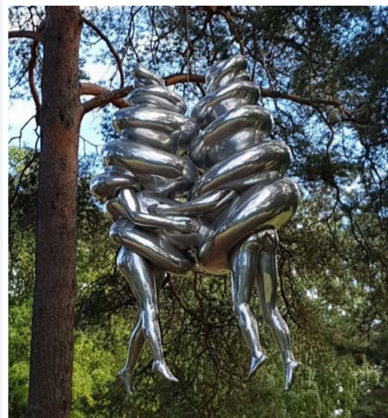
Photos (from top): Oslo Opera House ; Edvard Munch's The Scream, 1910, at the Munch Museum in Oslo; Louise Bourgeois's The Couple, 2003, at Ekeberg Sculpture Park