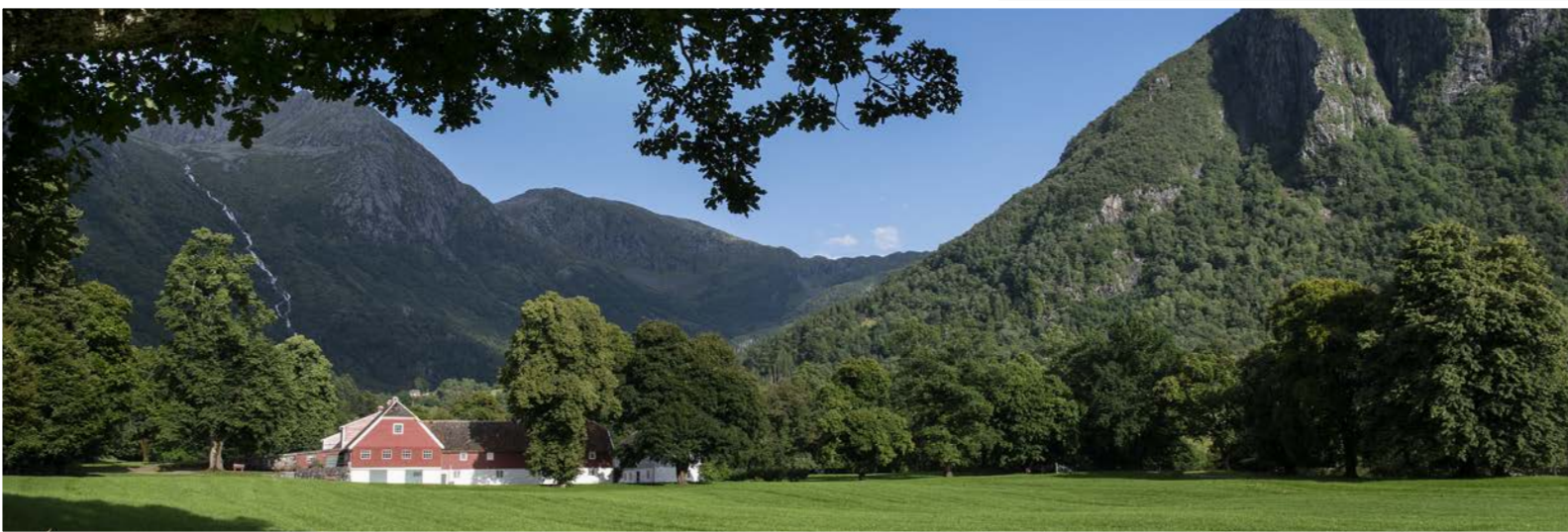
Below: Riddersalen Concert Hall at Baroniet Rosendal, site of the Rosendal Chamber Musical Festival