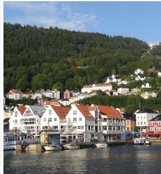
Photos (from top): The Rosendal Chamber Musical Festival; Bergen with view of the funicular in the background