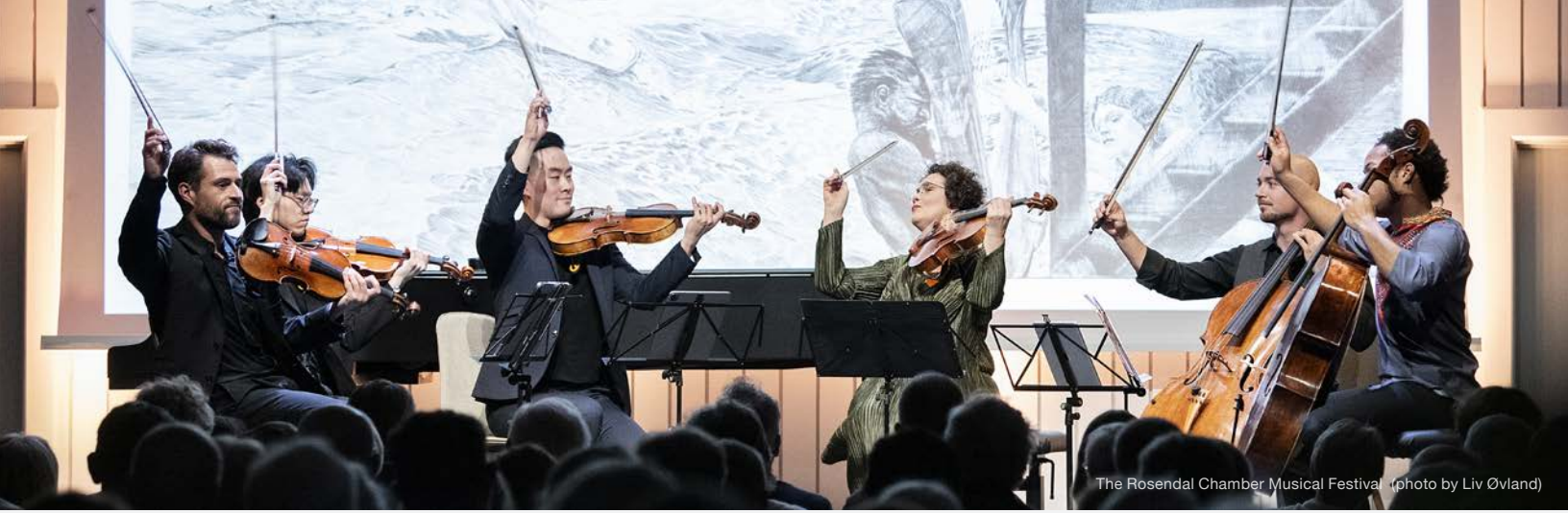
The Rosendal Chamber Musical Festival

Escape the summer heat and venture to Norway to attend the Rosendal Chamber Music Festival. Founded in 2016 by pianist and Artistic Director Leif Ove Andsnes, the Rosendal Chamber Music Festival has established itself as one of the most interesting and unique festivals of its kind.