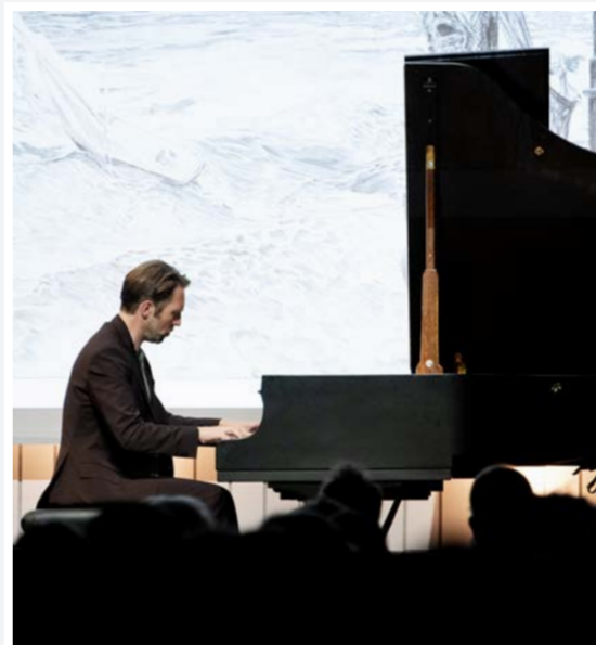
Photos (from top): Bergen ; Hardanger Fjord ; Pianist Leif Ove Andsnes at the Rosendal Chamber Musical Festival