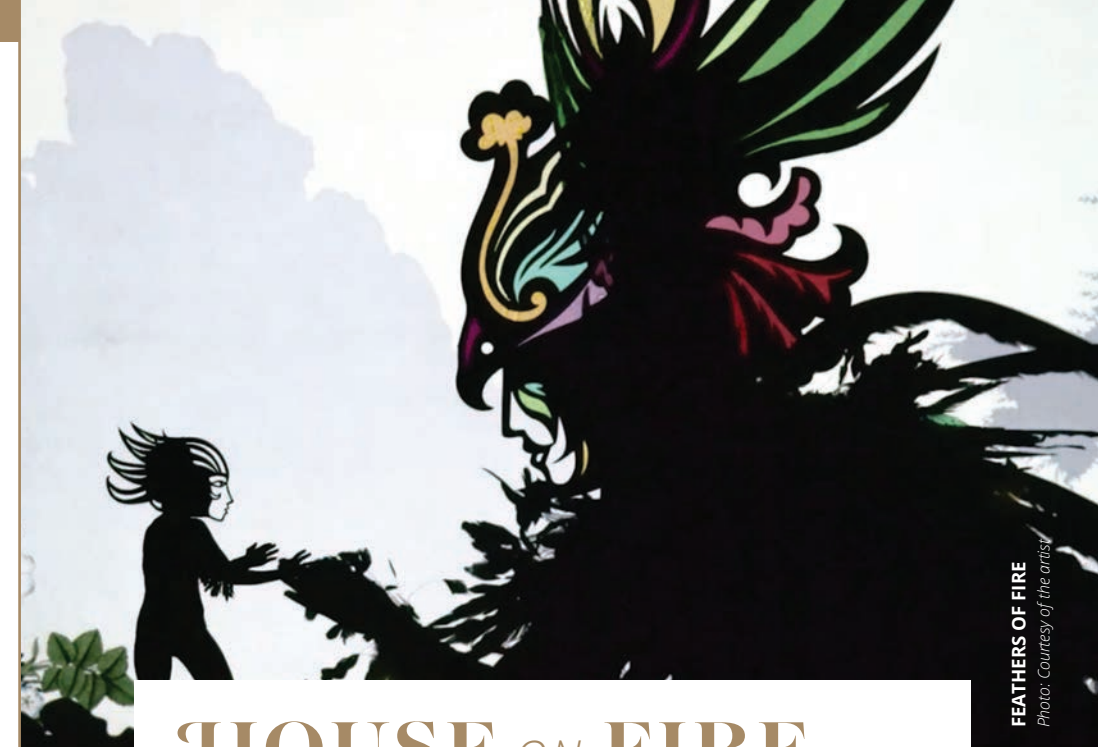
FEATHERS OF FIRE

The quartet introduced their instruments and talked about the different sounds they make. When they introduced Haydn's, The Lark , they explained which instrument would be playing the lark and asked the students to imagine what the bird was doing throughout the piece. The kids took the assignment seriously — their answers ranged from the poetic to the hilarious. Haydn would have been pleased.