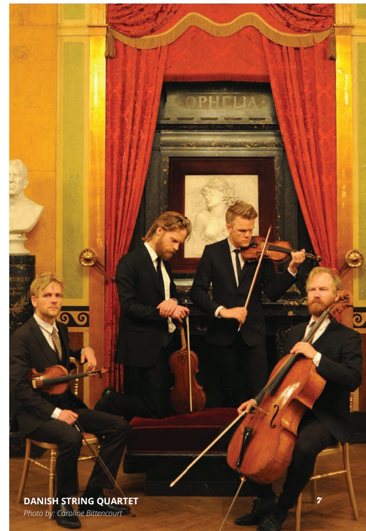
DANISH STRING QUARTET

The Danish shared the love on campus as well: first at a pop-up performance in the atrium of Odegaard Undergraduate Library, and then in a lively “sight-reading party” at the UW’s Parnassus Café, with over 30 amateur string players from both the UW and local high schools joining them to play string quartet music.