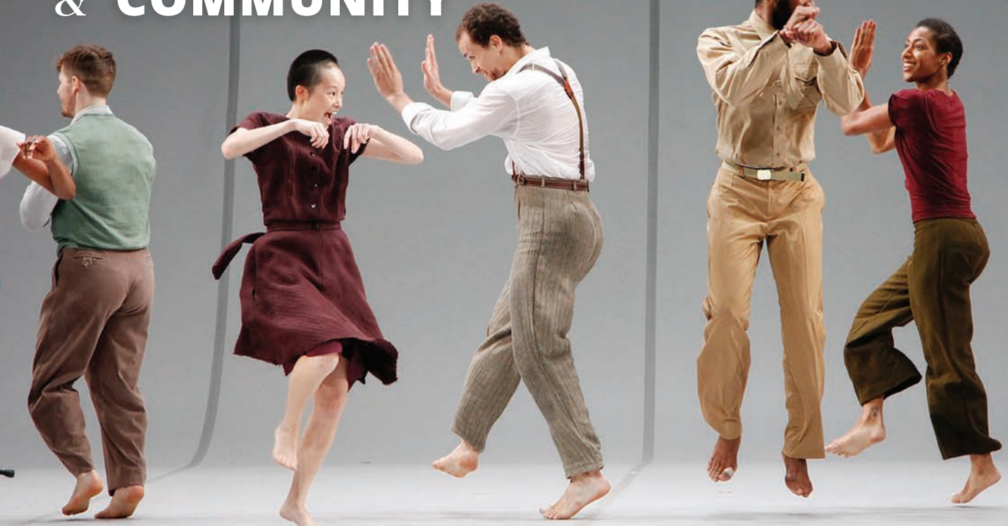
BILL T. JONES

In addition to the work you see on our stage each season, Meany Center offers our campus and community multiple opportunities to engage with the artists out from under the proscenium arch.