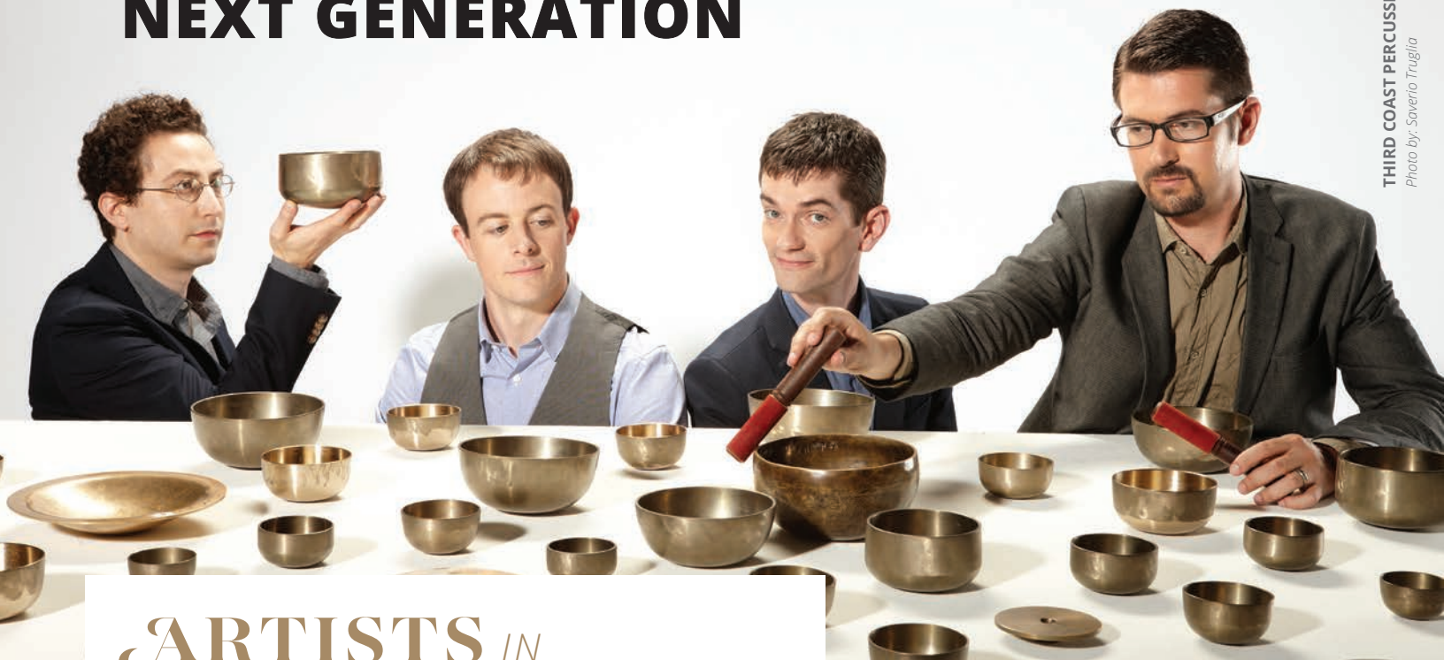
THIRD COAST PERCUSSION