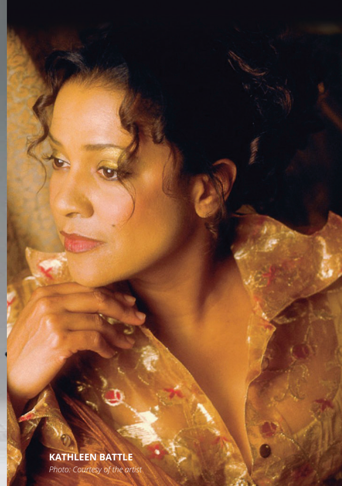
KATHLEEN BATTLE

With these performances, Meany Center became only the second venue in the world to present all three works over three consecutive evenings. The result was galvanizing. On the final night, the west lobby of Meany Hall crackled with creative energy as artist and audience members who attended all three performances engaged in a lively post-show conversation that continued the creative process even after the curtain had dropped.