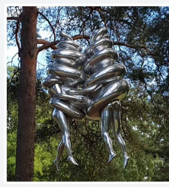
Photos (from top): Oslo Opera House ; Edvard Munch's The Scream, 1910, at the Munch Museum in Oslo; Louise Bourgeois's The Couple, 2003, at Ekeberg Sculpture Park